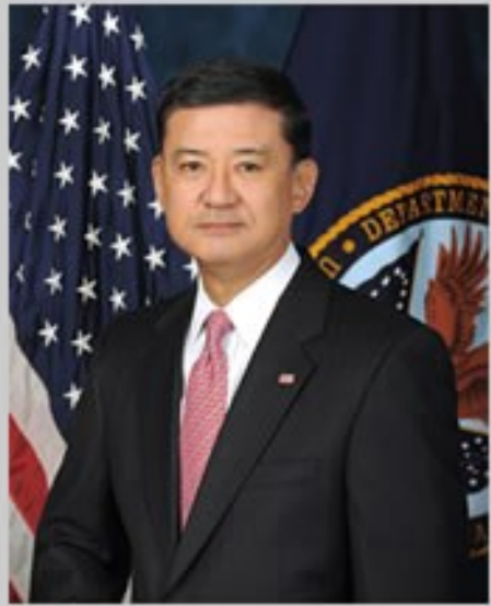
Department of Veterans Affairs Secretary Eric K. Shinseki